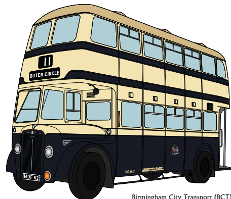
Birmingham City Transport (BCT)