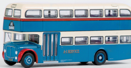
30710 AEC Renown A1 SERVICES Formed in the 1930's by Ayrshire Bus Owners, this Ardrossan based company of A1 Services operated a variety of buses including this AEC Renown. ASD 891D is seen working the trunk route from Ardrossan to Kilmarnock. JUNE RELEASE.

For EFE Stockists or to Buy Direct call: 020 8344 6720