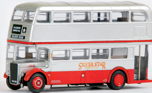
36004 Leyland RTL Bus SILVER STAR Ex London Transport Leyland RTL 305 looks very striking in the bright red and silver livery of Silver Star from Porton Down. Registered KGU 263, fleet number 36 operates a route to Market Square, Salisbury. MAY RELEASE.