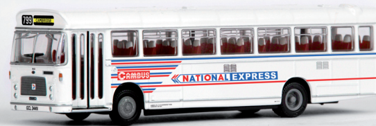
29409 Bristol RELH Dual Purpose CAMBUS N.B.C. This ex Eastern Counties dual purpose Bristol RELH is depicted in a later version of the National Express white livery as operated by Cambus. Registered GCL 344N, fleet number 153 operates route 799 to Cambridge from London Victoria Coach Station. MAY RELEASE.