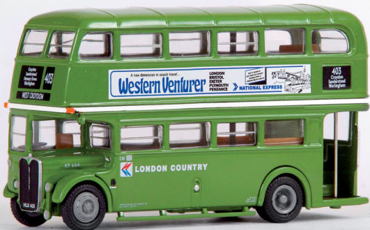
34105 AEC RT Bus LONDON COUNTRY N.B.C. Only five RT's ever got painted into N.B.C. London Country livery, RT 604 operates route 403 to West Croydon and registered HLX 421 it can still be seen today lovingly restored and working the bus rally circuit. MAY RELEASE.