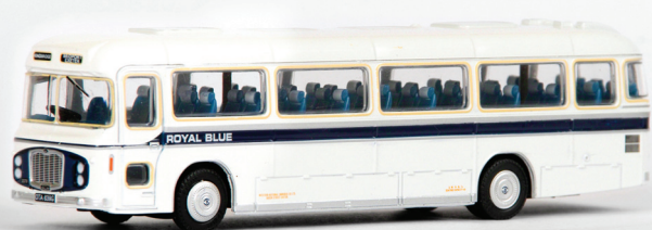
32305 Bristol RELH Coach ROYAL BLUE Royal Blue was a well used and respected company that would often vary the way they applied the distinctive Blue / Cream livery. In this livery variation 2379 registered OTA 639G is on route to Kingsbridge, Bridport and Exeter. MAY RELEASE.