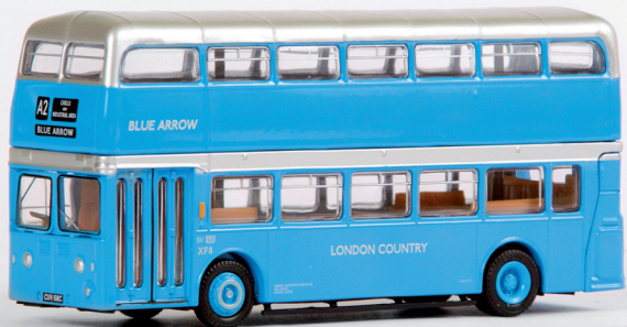
18206 Daimler Fleetline LONDON COUNTRY (BLUE ARROW) One of three XF's decorated in "Blue Arrow" livery. These blue and silver London Country Daimlers operated a service for the workers of Stevenage. Registered CUV 58C, XF 8 operates route A2 to Chels and the Industrial Area. JUNE RELEASE.