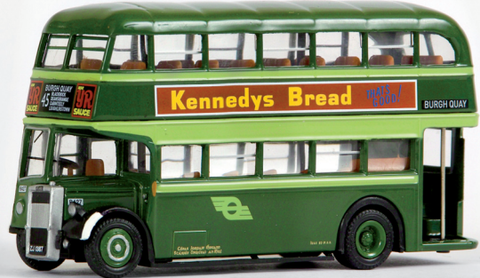
16132 Leyland PD 2 Highbridge C.I.E. Complementing our earlier release in their blue livery is this "Capetown" type Leyland PD 2 Highbridge in C.I.E. green livery. Registered ZJ 1387, fleet number R427 works route 45 to Burgh Quay. JUNE RELEASE.