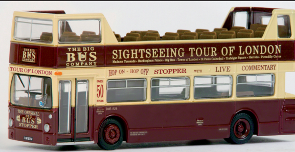
27902 Daimler DMS Bus BIG BUS COMPANY A common sight on London's Streets, this Big Bus Company Daimler DMS works the hop on service with over fifty stops. Registered THM 528M, fleet number DMS 1528 continues to add to our models in this fleet. MAY RELEASE.