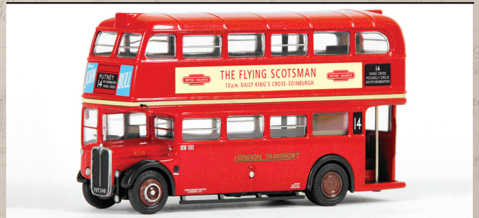
34303 AEC 2 RT 2 Bus LONDON TRANSPORT AEC 2 RT 2 Bus registration number 248 FXT, Fleet number RT 73. This central London Transport bus operates route 14 to Putney, with period British Railway adverts it is sure to prove popular.