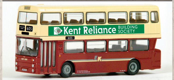
28908 GM Standard Atlantean EAST KENT This GM Standard Leyland Atlantean was one of a large batch acquired by East Kent from Greater Manchester Buses in the late 1980's. Registered ONF 657R, fleet number 7557 works route 605 to Whitstable, Herne Bay and Hillborough.