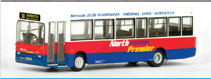
20647 Plaxton Pointer Dart NORTH WESTERN PREMIER Our Plaxton Pointer Dart is route branded showing North Western Premier Services 37/38 to Warrington, Thelwall, Lymm and Altrincham. Registered M172 YKA, fleet number 1172 operates route 38 to Warrington Bus Station.