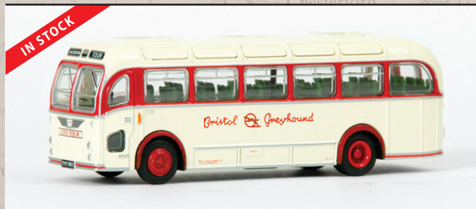
16220 Bristol MW /LS BRISTOL GREYHOUND Registration number THY 952, fleet number 2878 works a Bath City Tour. August 2006 release. IN STOCK