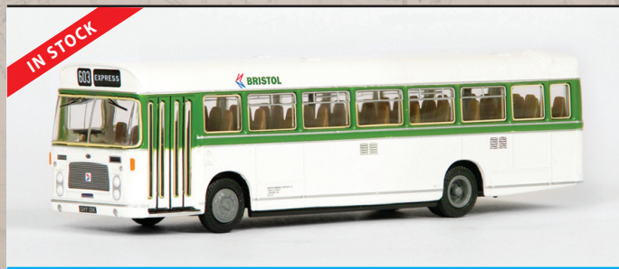
29412 Bristol RELH D/P Bus BRISTOL OMNIBUS N.B.C. Registration number GHY 131K, fleet number BH 2069 works Express route 603. November 2012 release. IN STOCK