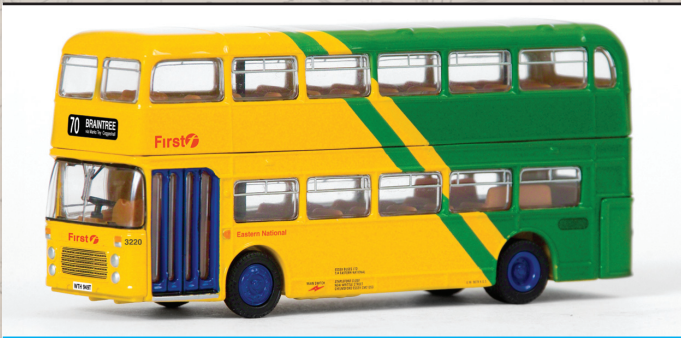
20456 Bristol VR III FIRST EASTERN NATIONAL A familiar sight on the roads of Essex, the green and yellow colours of First Eastern National Bristol VR III. Registered WTH 949T, fleet number 3220 works route 70 to Braintree via Marks Tey, Coggleshall.