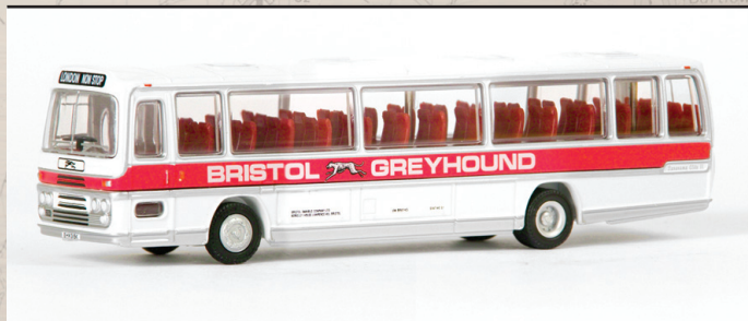
29501 Plaxton Panorama BRISTOL GREYHOUND Registration number EHW 315K, fleet number 2161 works a 'Non Stop' route to London. February 2004 release. NO STOCK