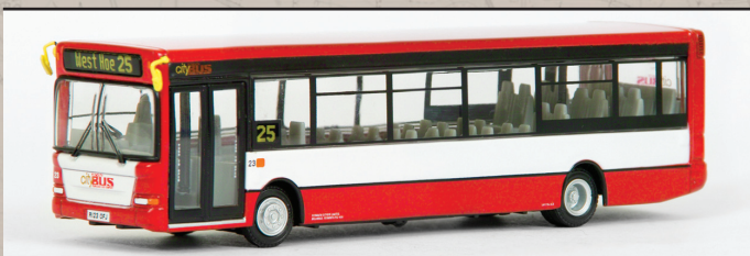
36708 SLF Dart Series 2 One Door Bus PLYMOUTH CITYBUS Continuing to build our Plymouth Citybus fleet of vehicles their red and white livery looks very smart on our SLF Dart casting. Registered R123 OFJ, this single door series 2 Dart fleet number 23 Operates route 25 to West Hoe.