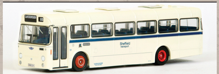
35212 AEC Swift 6 Bay Bus SHEFFIELD TRANSPORT A new variation on our 36' BET 6 Bay casting, this AEC Swift is decorated in the livery of Sheffield Transport. Registered DWB 51H, fleet number 51 operates route 85 to Gainsborough.