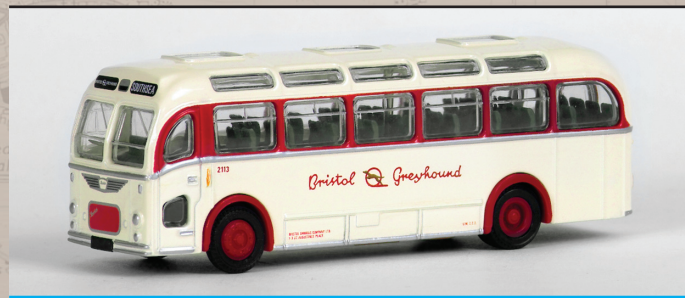
16201 Bristol MW Coach BRISTOL GREYHOUND Fleet number 2113, en route to Southsea. December 1993 release. NO STOCK