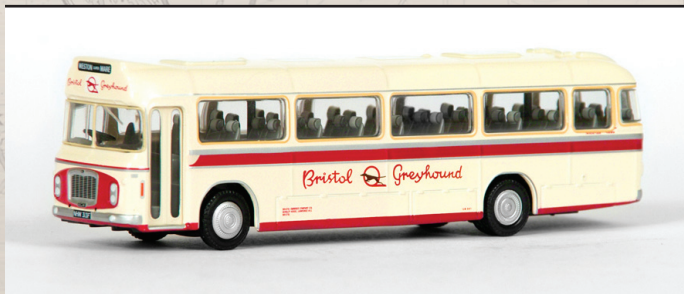
32402 Bristol RELH Coach BRISTOL GREYHOUND Registration number NHW 313F is operating a route to Weston Super Mare. October 2009 release. NO STOCK