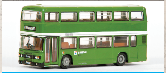
29704 Leyland Olympian BRISTOL N.B.C. Always popular with collectors of our models this Bristol Omnibus Company Ltd Leyland Olympian is depicted during the National Bus Company period. Registered JHU 911X, fleet number 9512 operates route 141 to Burnham on Sea.