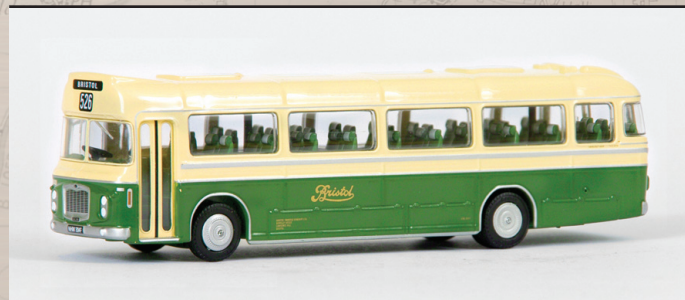
32401 Bristol RELH Coach BRISTOL OMNIBUS Registration number NHW 304F, fleet number 2050 works route 526 to Bristol. November 2008 release. NO STOCK