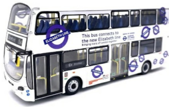
Model Buses Creations - CP46504A/B - Pre Production Sample

We are producing 2 Destinations Including route 104 to Stratford and Beckton Station.