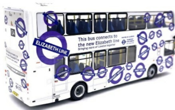
Model Buses Creations - CP46504A/B - Pre Production Sample

limited to 500 units on each destination. Both versions available to pre order at £46.90 each or the twin pack at £90.00.