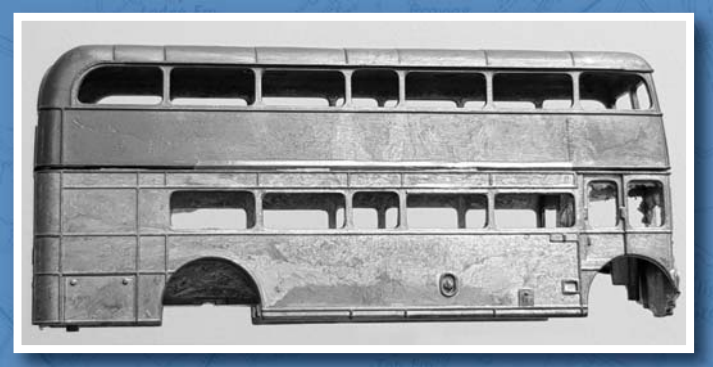
BEFORE modification Existing RML casting does not have panel rib detail.

Current progress on the 'RML' type as at November 2018 is shown below.